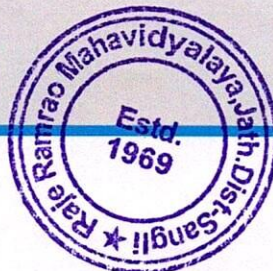
I/c Principal Raje Ramrao Mahavidyalaya Jath, Dist. Sangli,