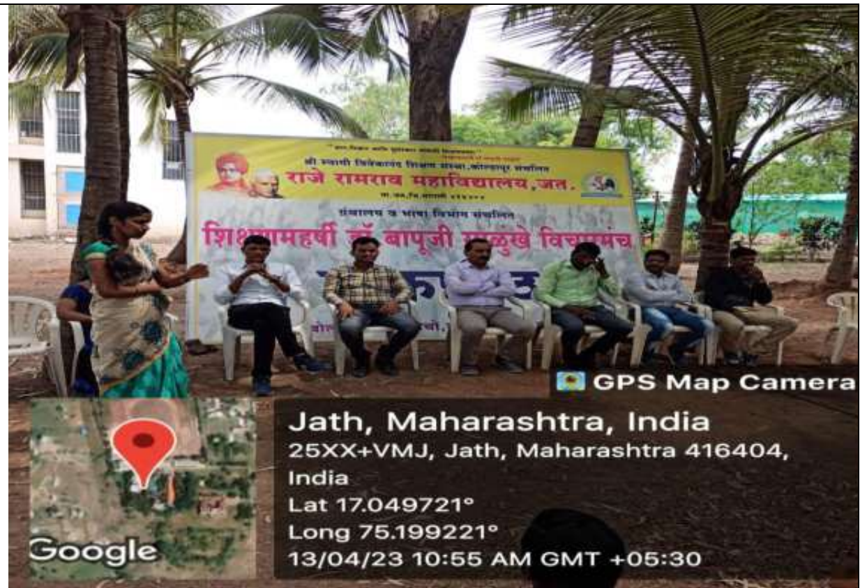
While the Teacher is guiding the students