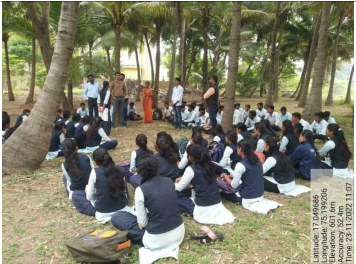
While students are expressing their opinions