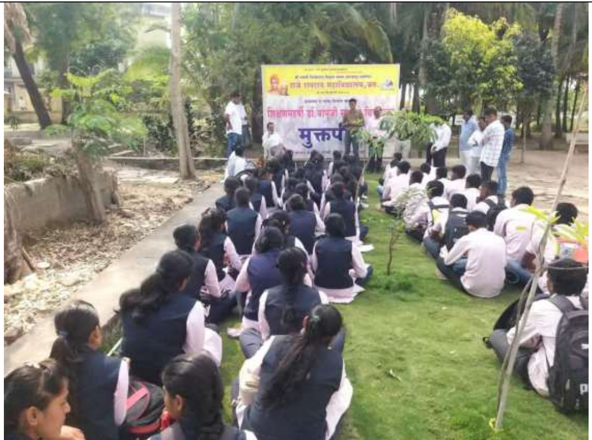
While the principal is guiding the students