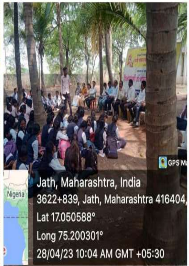
Discussion on the topic