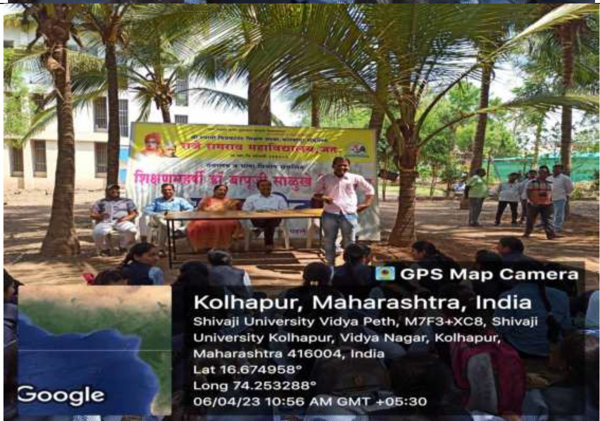
students telling Marathi stories