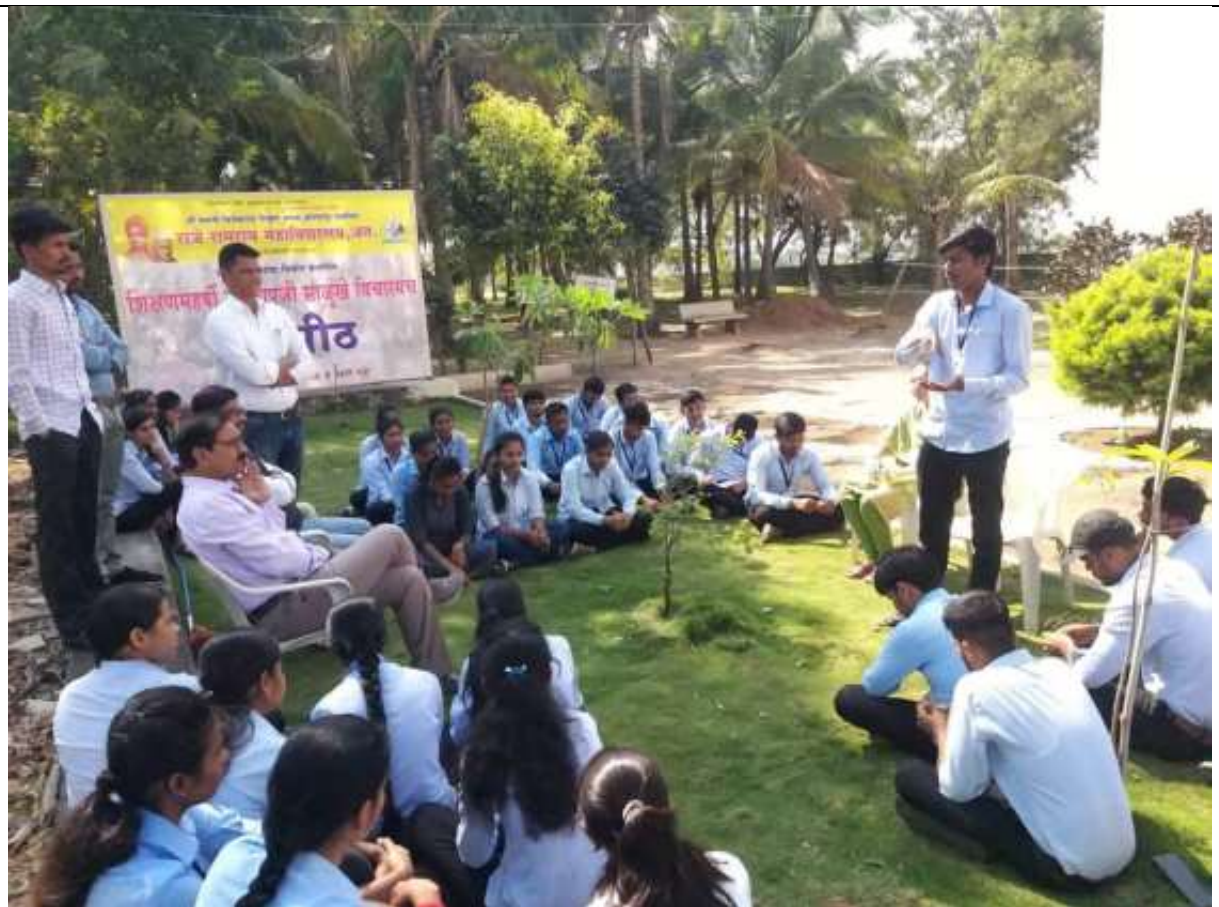
While the principal is guiding the students