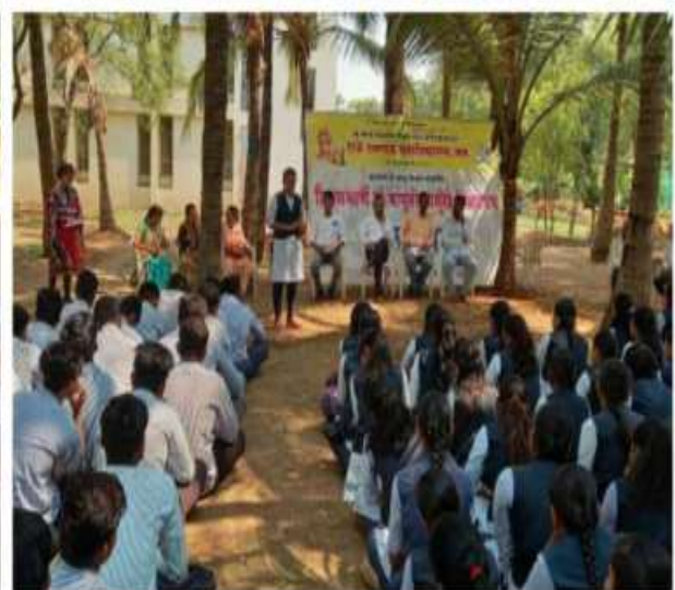
Teachers & Students Speaking