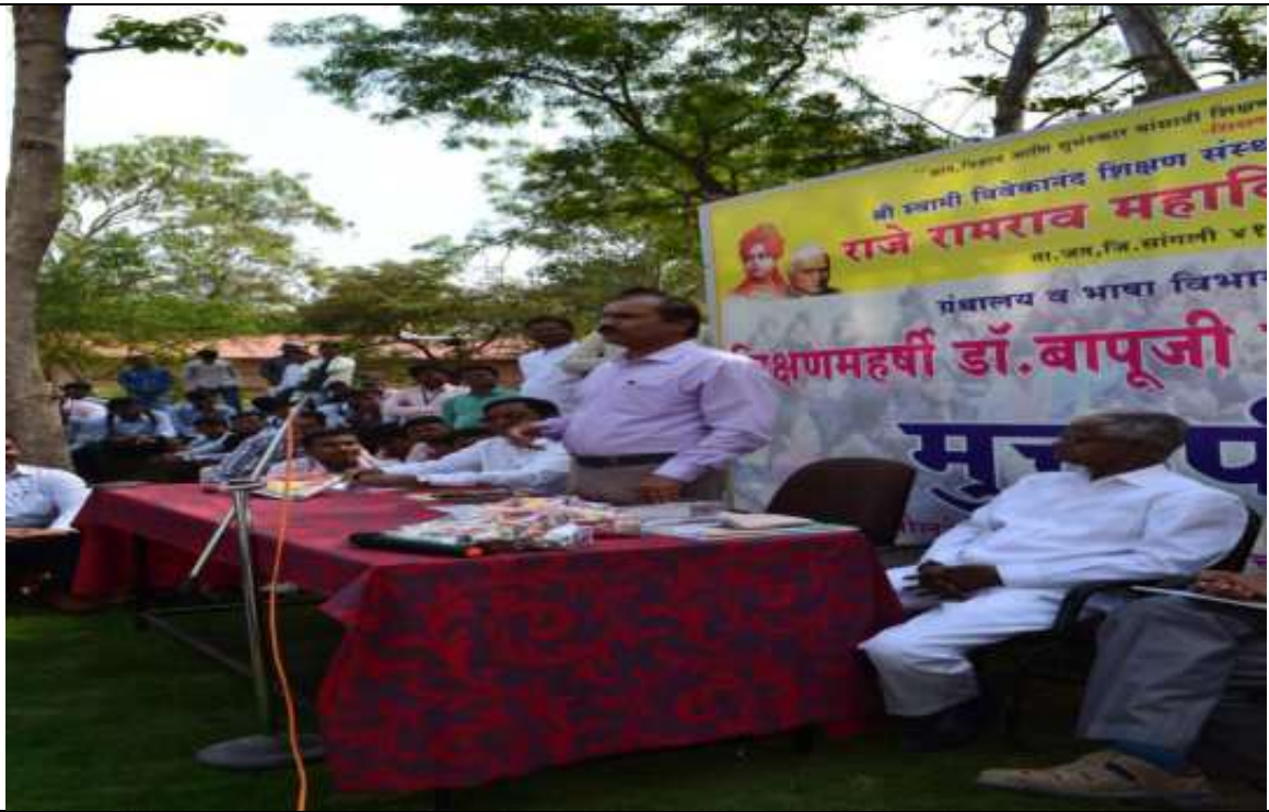
While the principal expressing