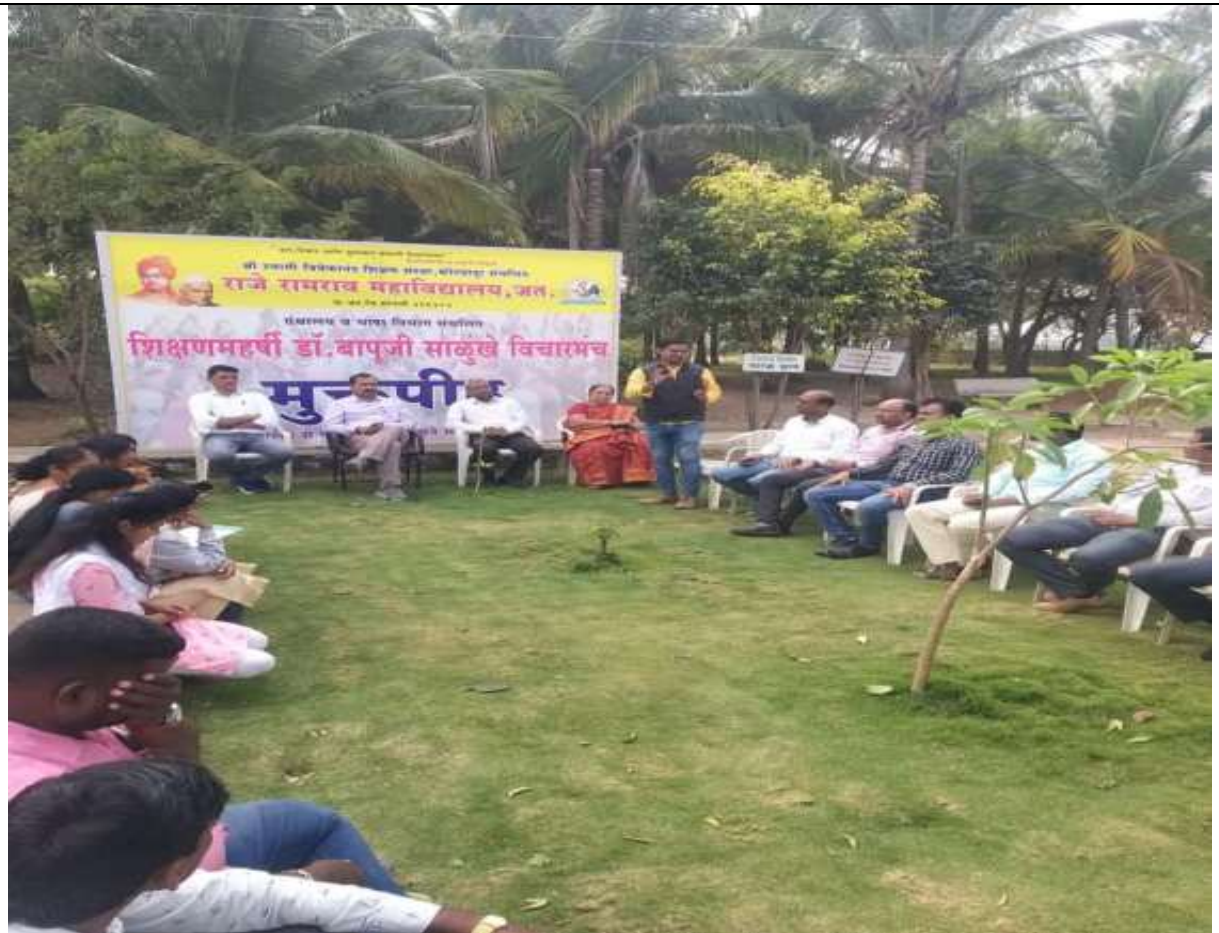
While participants are expressing their opinions