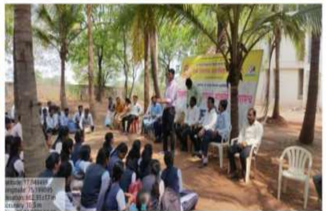
Teachers & Students Speaking