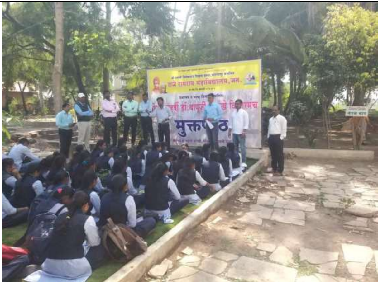
While students are expressing their opinions