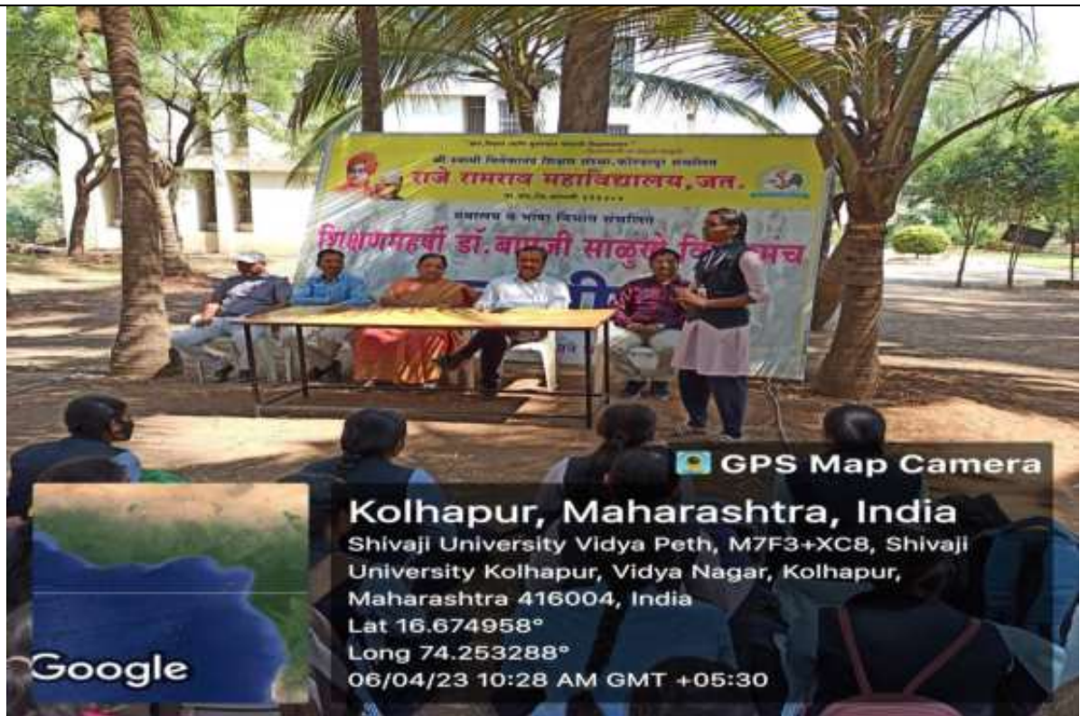
A student telling about Marathi proverbs