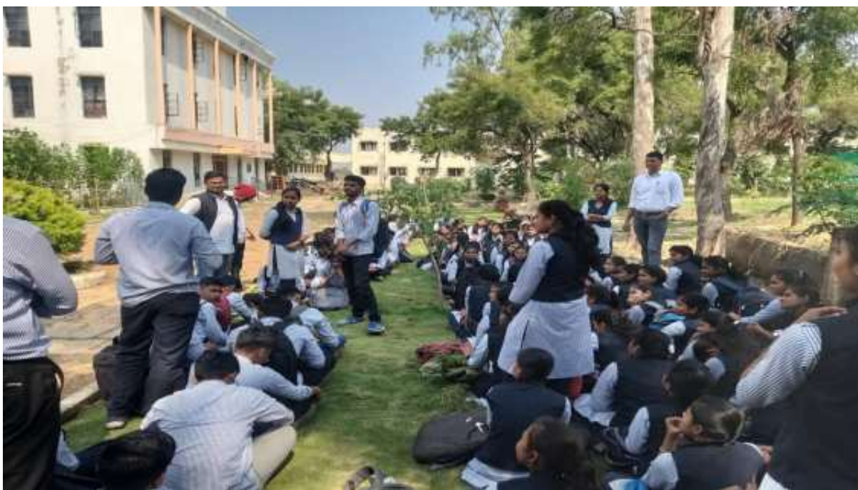
Participate of the Students