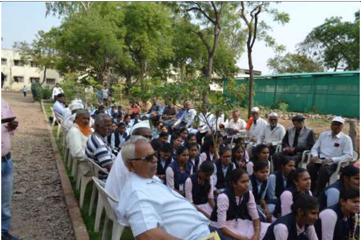
Attention of Senior citizens and students