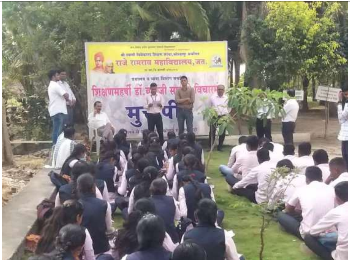
While students are expressing their opinions